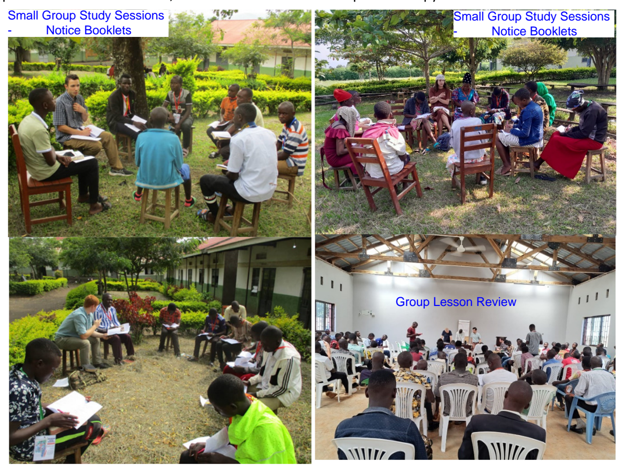
(There was a need for a flip chart to help with the lessons. The Lord directed us to the exact right shop to purchase one - then we had to make a stand for it.)

This was followed by small group studies, where MAG team participants could interact with the campers directly, discussing the lessons that had been taught through a list of questions provided to each one in their camp booklets. These booklets included the scripture portions being discussed, as well as ample space for answers and notes, so each one could take their personal copy home for future reference.