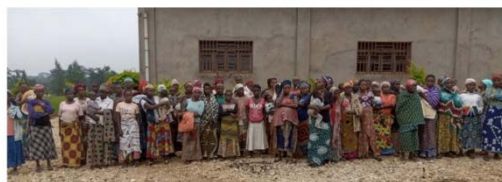
Refugees in Goma area who found no place in the overcrowded camps