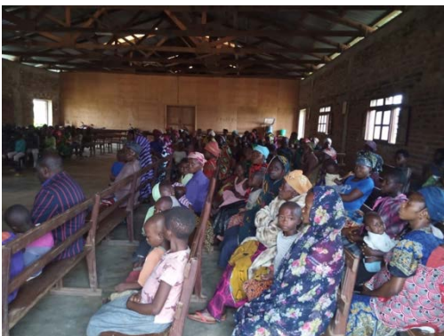
Hundreds of refugees at our Bible Conference Center In Mputu