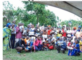
Displaying copies of the calendars received