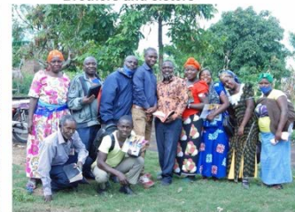
The team, involved in the preparations

Last year, they received from us about twenty USB sticks with recordings of Bible lectures given by different brothers in English and French. These were given to some families, who also copied the contents for others. In the past, they have also received audio Bibles twice in Lhukonzo and Luganda, which have been given to people who cannot read (especially the elderly and blind). These two devices are a wonderful tool for Bible teaching, and we are thankful to the Lord that they are appreciated.