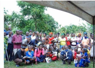
Brothers and sisters