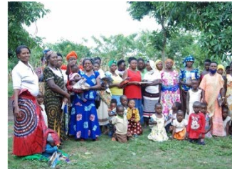
Young girls and women

Many school directors give them permission to bring the gospel to their students, even from Muslim-founded schools. The young brothers have established groups in these schools from which students receive and do Bible courses. It also helps them to keep in touch and correspond with students who show interest. Because of the lockdowns, some students were at home, but they could be visited there. This year we also regularly received large quantities of reading material for distribution in markets and in the schools mentioned, especially the quarterly magazine 'The Christian Explorer', and also the calendars 'Good Seed' and 'Lord is Near' and 'Beautiful Africa'.