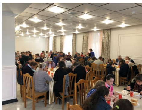
Meal time at the conference in Cahul.