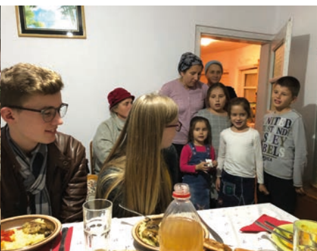
Some of the children sang for us after the meeting in Barbuletu.